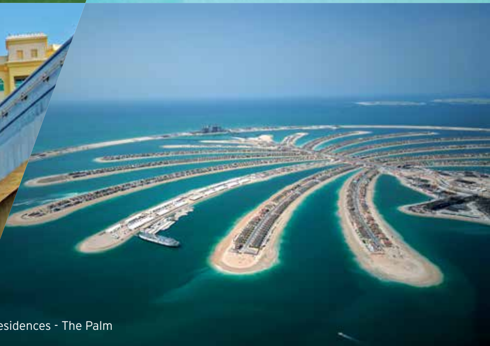
Residences - The Palm