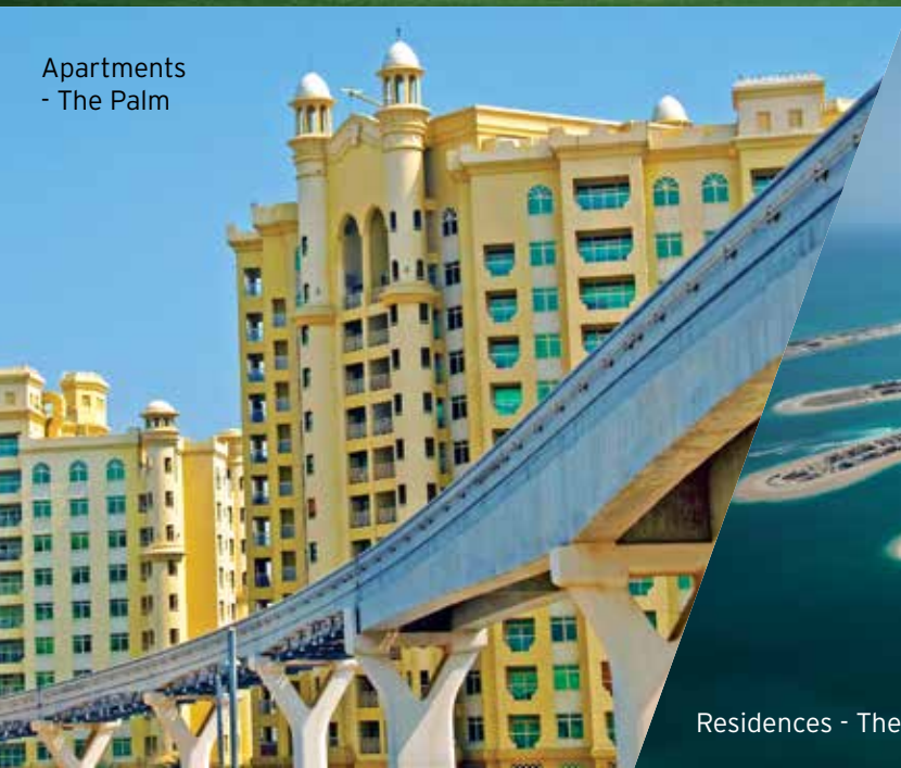
Apartments - The Palm