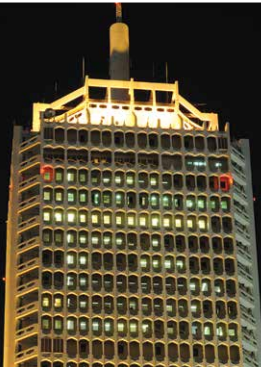
World Trade Center

Pidilite has a proven track record in the Middle East for more than 10 years and now operates out of a modern purpose built factory at Dubai Investment Park II, manufacturing and supporting a proven range of construction chemicals tailor made specifically for the GCC market. These broadly cover, flooring solutions, tile adhesives, concrete repair and finishes, sealants, waterproofing and surface plasters.