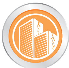
CONCRETE & STRUCTURAL REPAIR