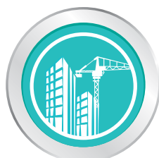
SPECIALITY CONSTRUCTION PRODUCTS