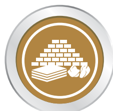
MARBLE & STONE PROTECTION