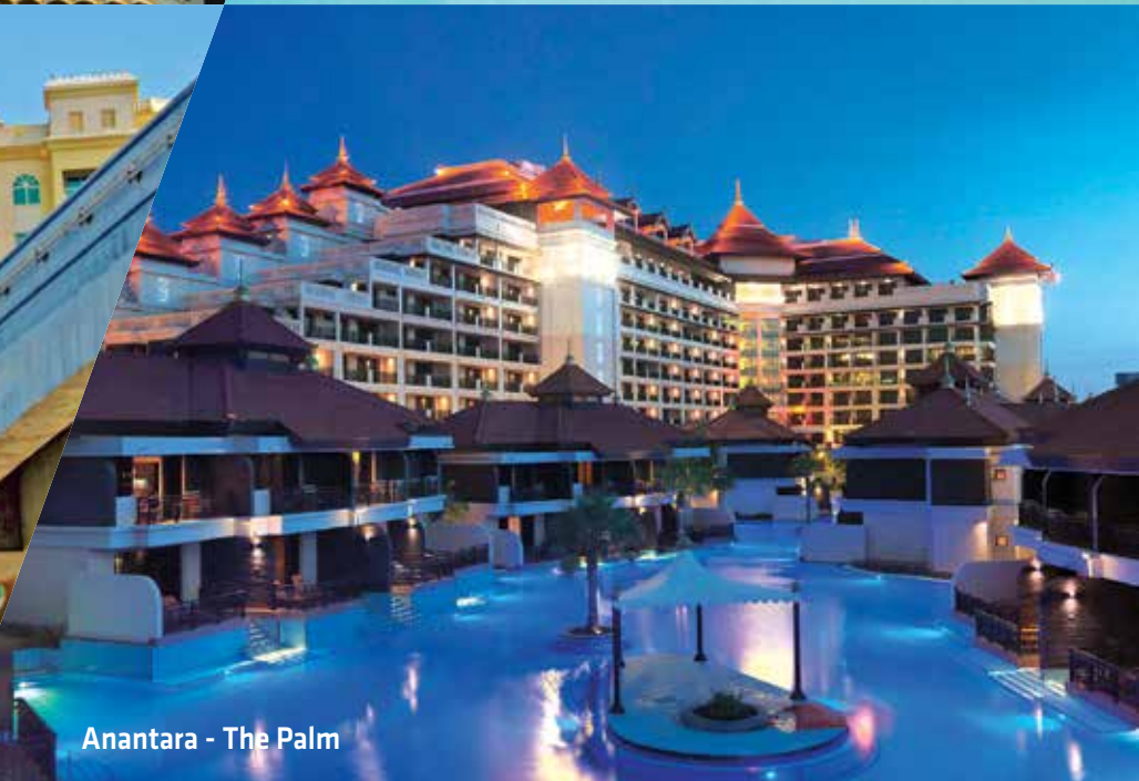
Anantara - The Palm